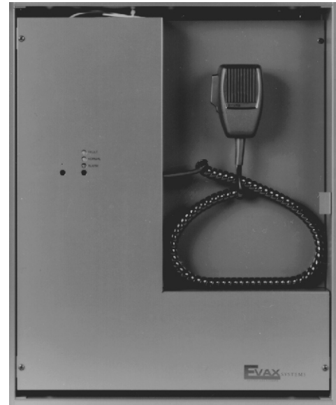
EVAX 25 shown with Keylocked Door Removed